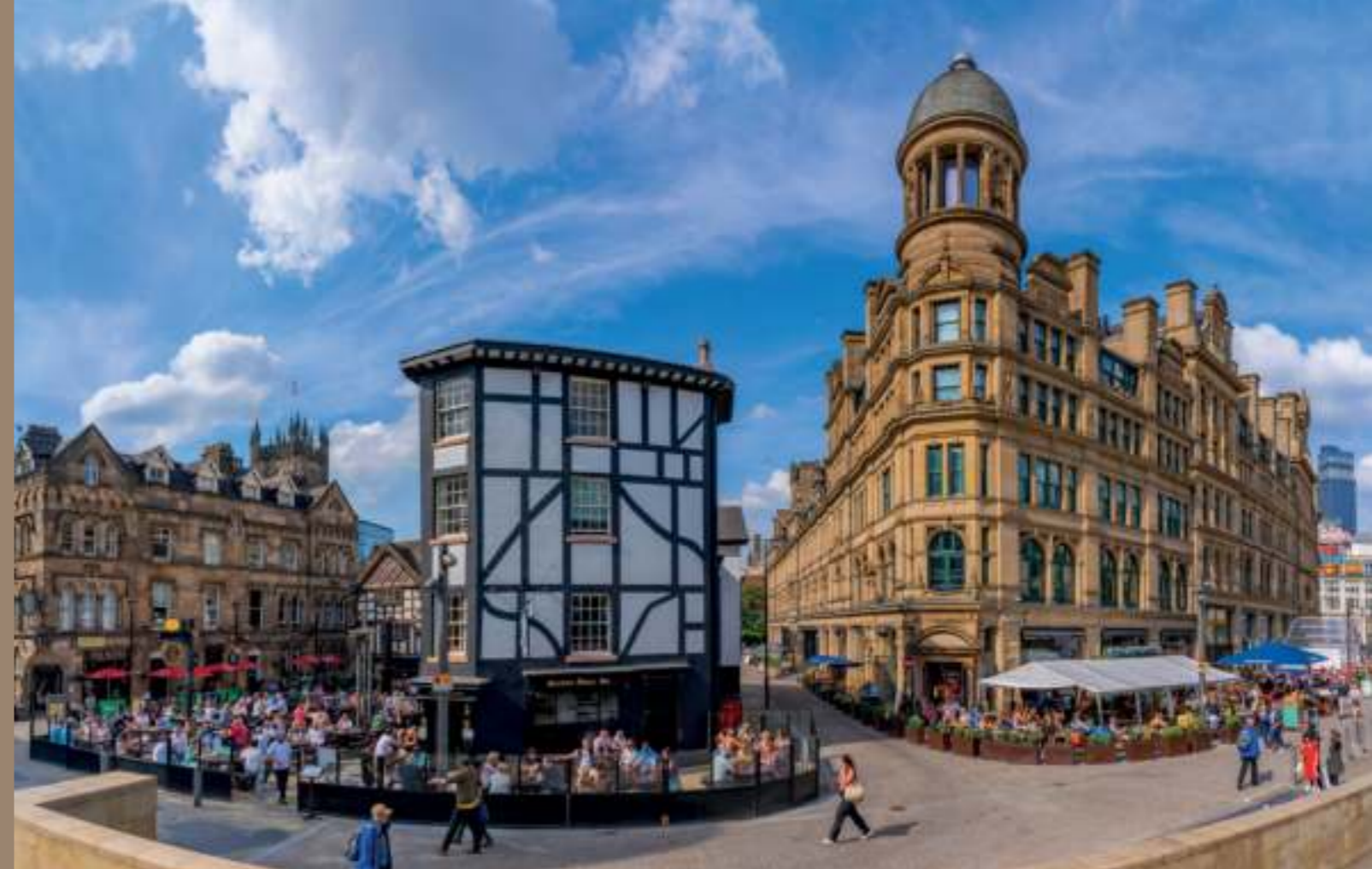
Right Mackie Mayor, Northern Quarter