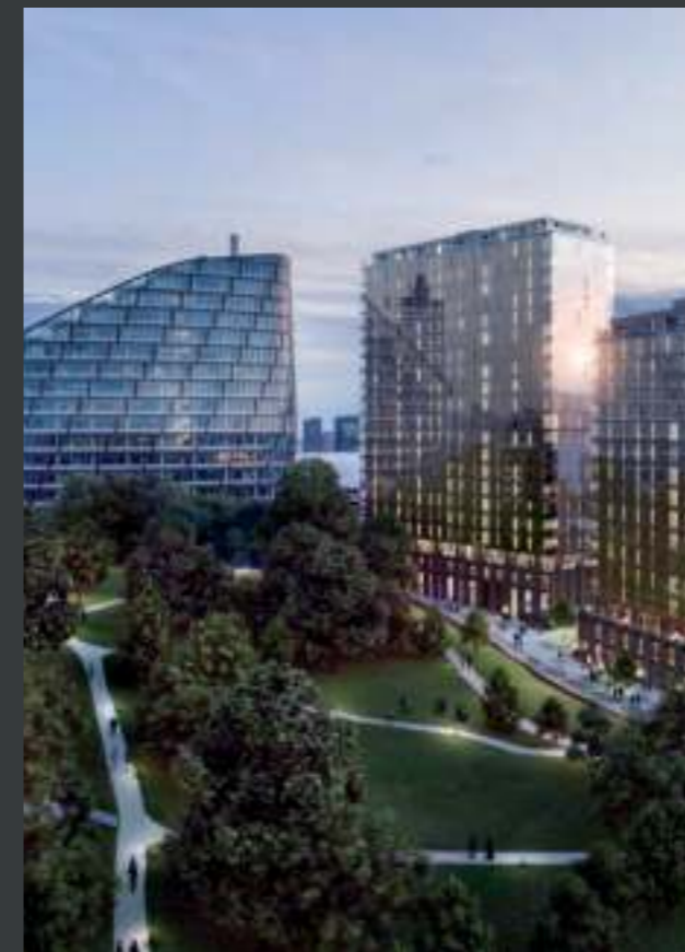
Above Meadowside, Manchester