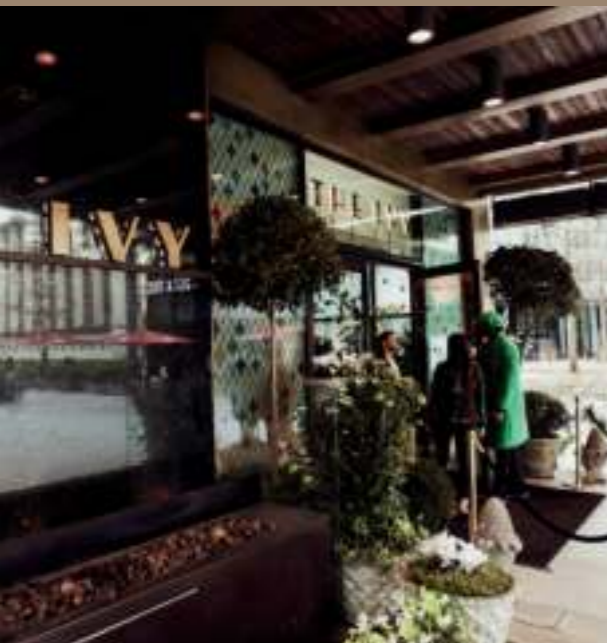
Left The Ivy Spinningfields

Manchester's food scene is as varied and vibrant as its art and culture.