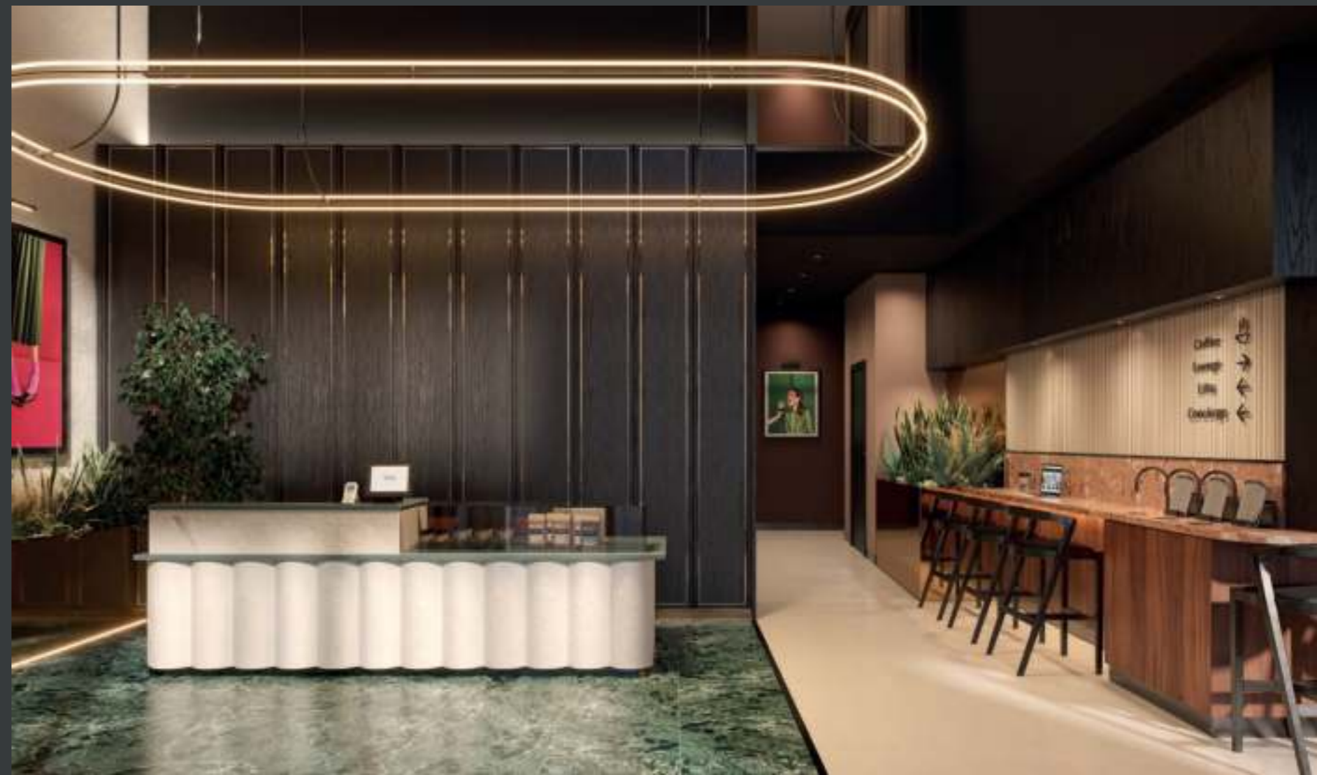
Below Park View Concierge

Breath of fresh air? Residents can enjoy the exclusive, tranquil Crown Gardens as well as having access to the extensive landscaped City Gardens podium in wider Victoria Riverside estate.